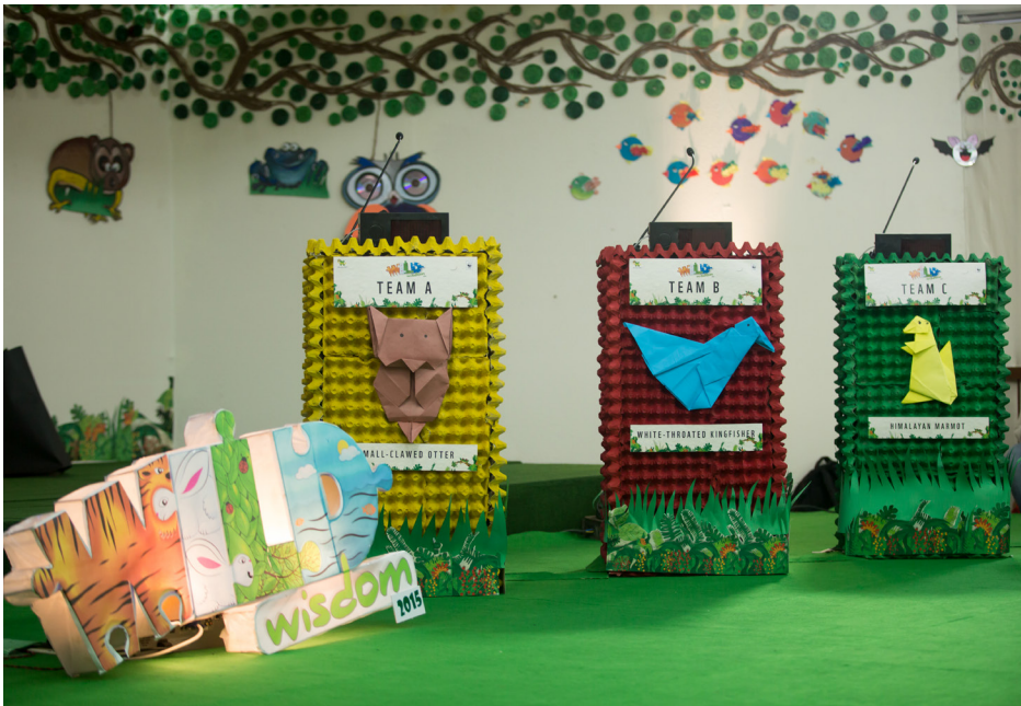
Figure 7 The set made of recycled material received great appreciation

This year, a novel concept was used in creating the set for the National Final. An attempt was made to incorporate the ideology of the 3 Rs’ – reduce, reuse and recycle. The set was entirely made out of recycled material like newspapers, bottle caps, ropes, wires, egg shells, used CDs and received great appreciation.