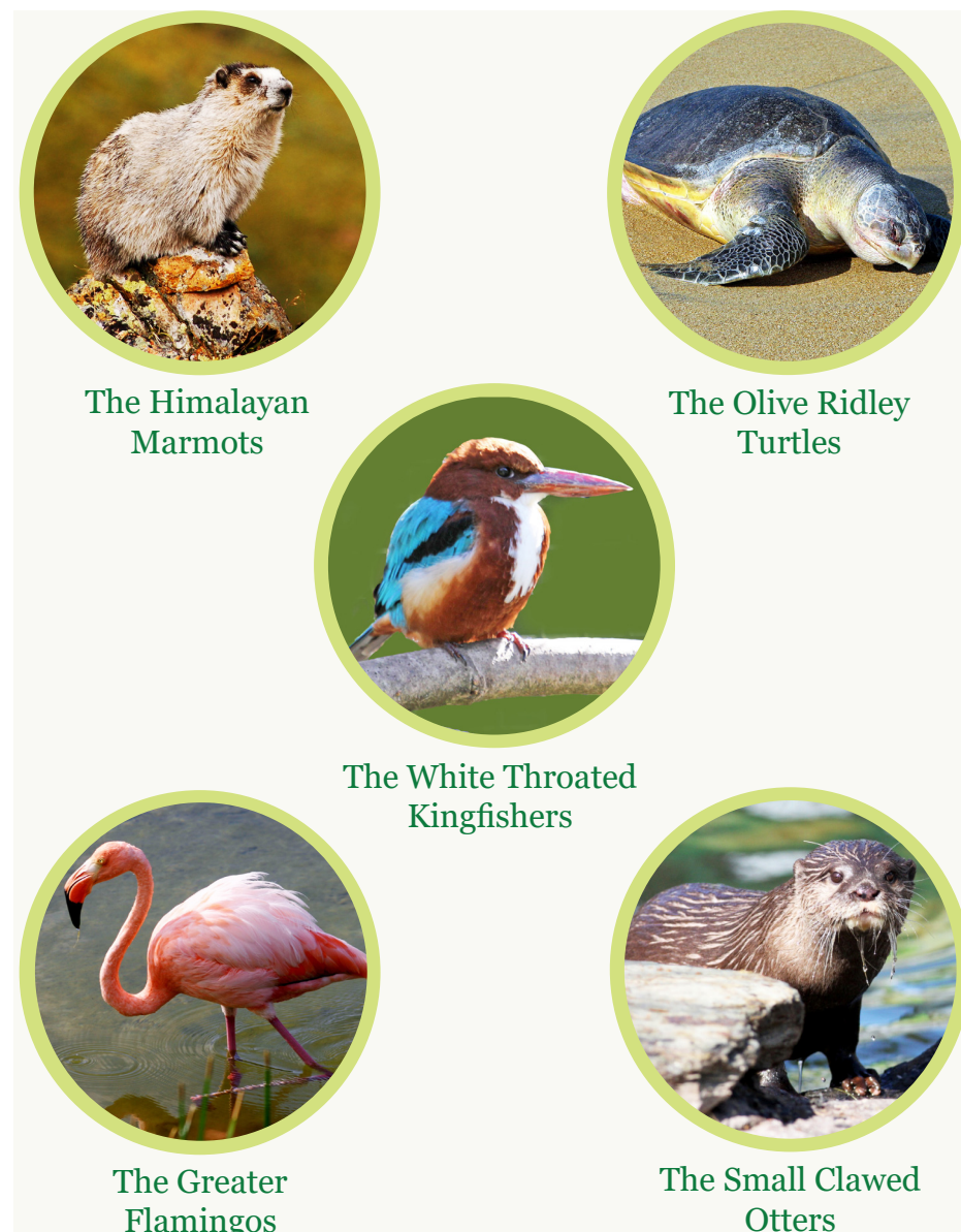
Figure 3 Names of participating teams were based on these animals and birds

The names of the five teams this year were animals and birds that are closely linked to soil. They were: