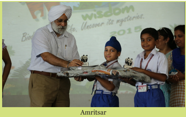
Figure 5 Junior Level winners of Wild Wisdom Quiz 2015