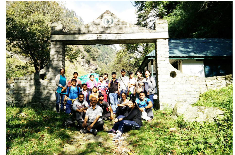
Figure 11 At the entrance of the Great Himalayan National Park

In the reflective session, they all discussed their observations and what all they had seen through the day. The experience was an eye-opener for all and the winners shared how their senses were active and heightened as a result of keeping silent and they effectively communicated their thoughts with each other. They felt that their observation skills had undergone a change and improved. The night ended with group activities like an informal dance competition and then everyone sat together and observed the night sky.