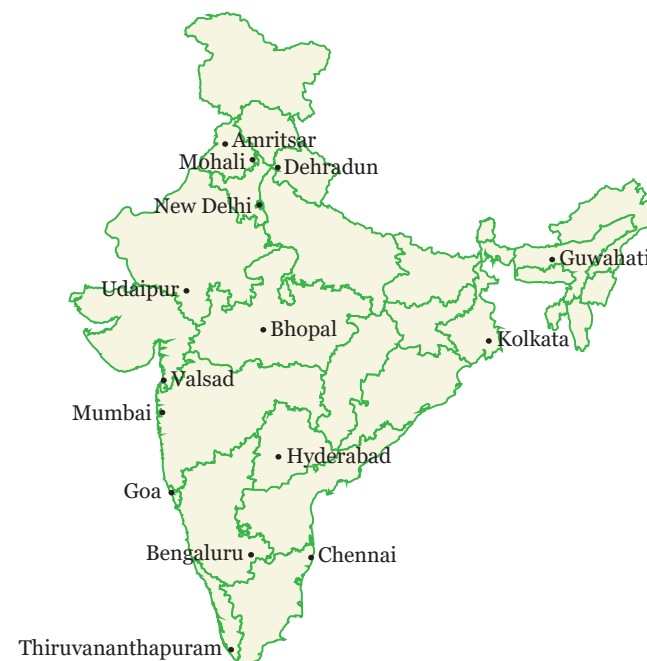
Figure 1 Map of India showing the 15 cities that participated in the Wild Wisdom Quiz 2015

Outreach of more than 10,000 schools pan-India (CBSE, ICSE, KVs and State Boards) 15 Cities have held state level events of the quiz | Current participation pan-India : 26,000 students