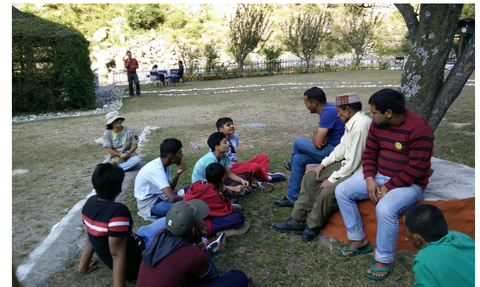
Figure 12 Students talking to the forest guard

In the reflective session, they all discussed their observations and what all they had seen through the day. The experience was an eye-opener for all and the winners shared how their senses were active and heightened as a result of keeping silent and they effectively communicated their thoughts with each other. They felt that their observation skills had undergone a change and improved. The night ended with group activities like an informal dance competition and then everyone sat together and observed the night sky.