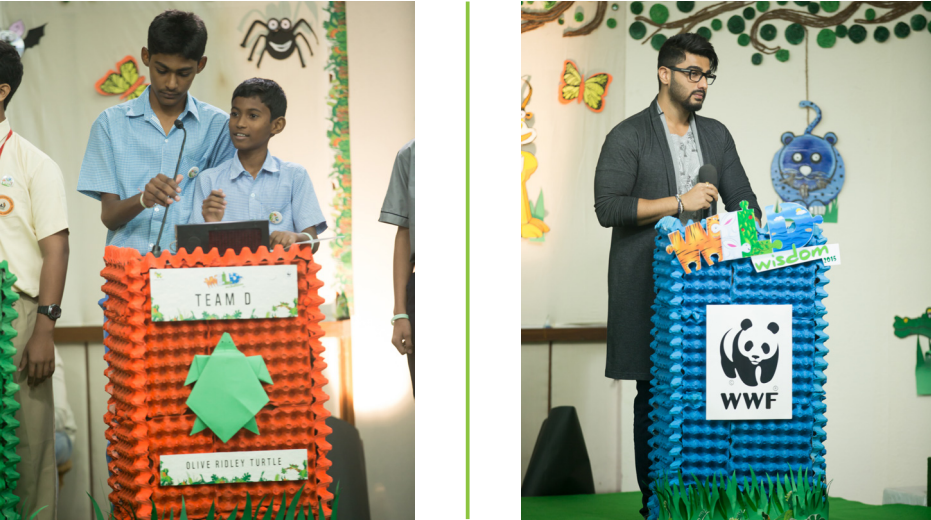
Figure 8 & 9 Left: One of the winning teams of Wild Wisdom 2015 Right: Brand Ambassador Arjun Kapoor hosting the quiz