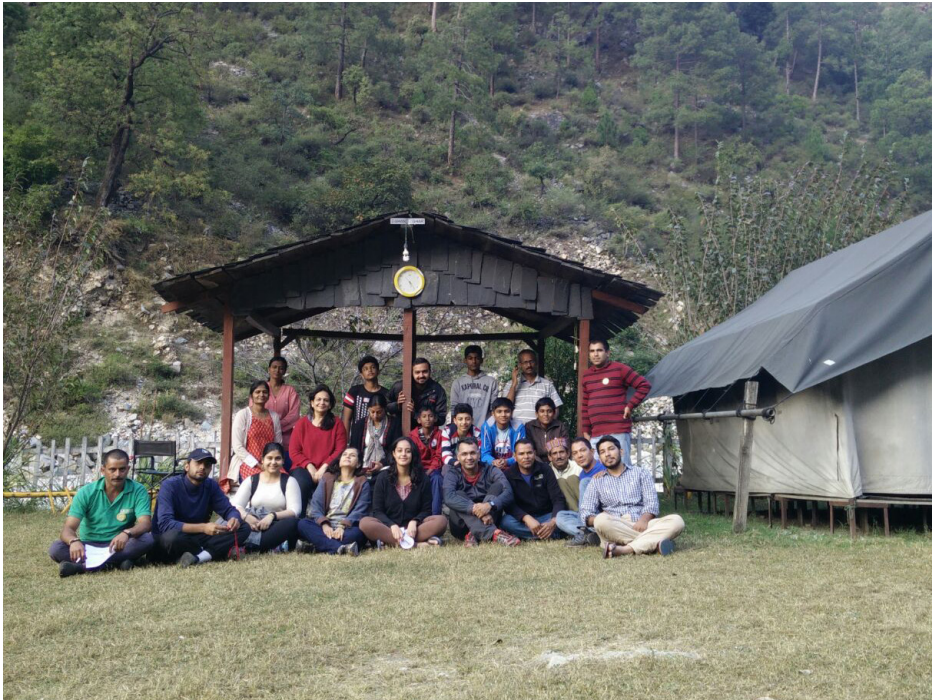
Figure 13 The winners, Wild Wisdom team and Chrysalid camp guides at the camp site

Hence, the whole trip provided a well rounded and holistic outdoor experience that the students will cherish for a long time.