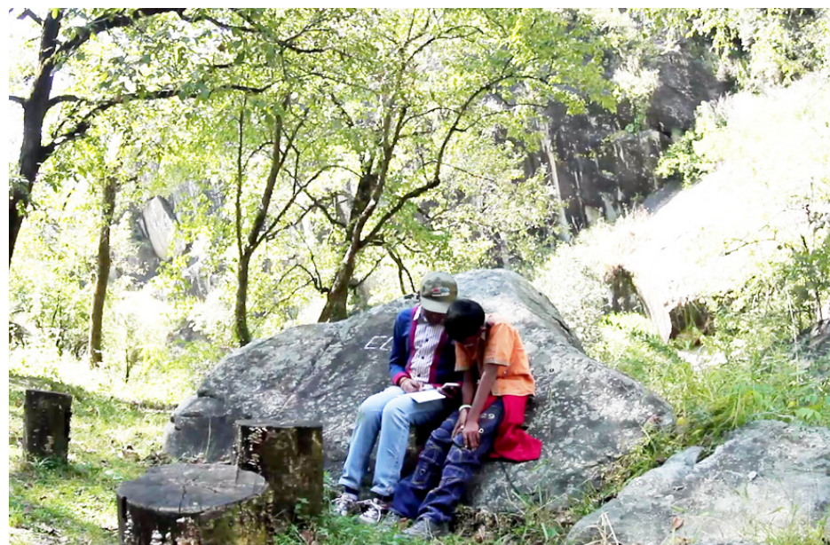
Figure 10 The students documenting their observations in their journals

While making the ascent up to the park, the children were asked to be silent in order to feel more in touch with nature and to feel the experience more deeply. They observed species of trees, plants and insects and kept documenting it along the way.